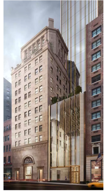
Peep the staircases at 111 W. 57th St.