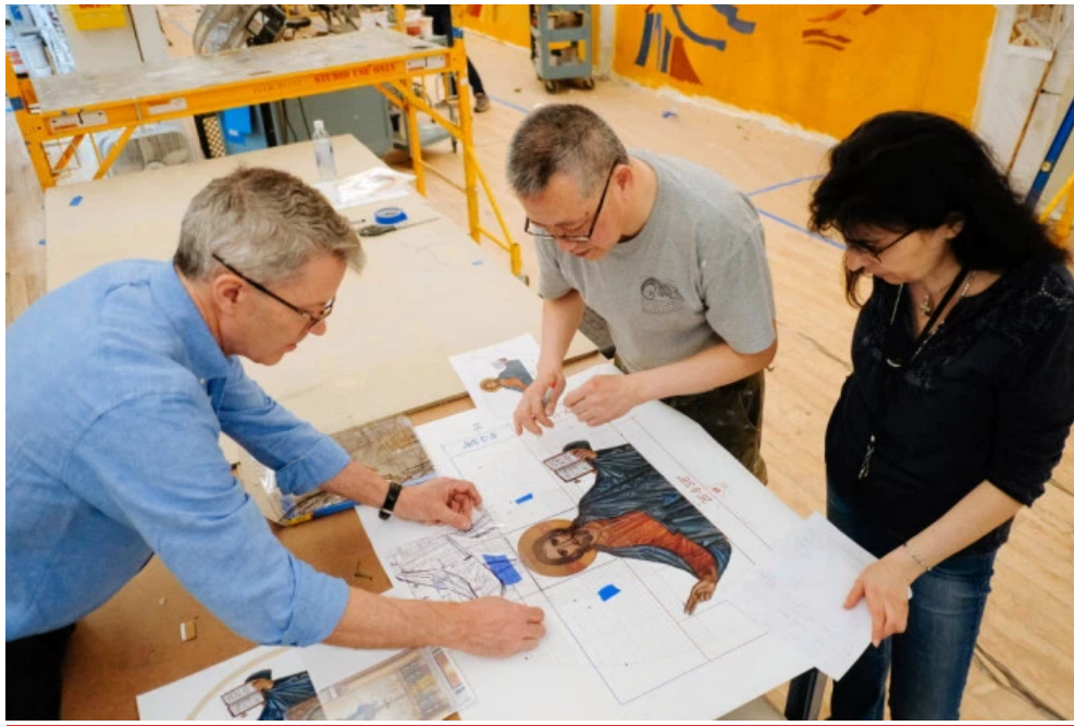
Restoration work on places like the Sherry Netherland's lobby is carried out at EverGreene Architectural Arts' Brooklyn studio.